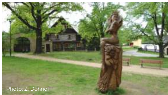
Staré Splavy - Queen of the Lake

The dominant feature of the region is one of the most important early gothic castles in Bohemia – Bezděz . This royal castle was built on a hilltop (638 m a.s.l.) between 1260-1279 by a Czech king Přemysl Otakar II. The king Václav II. with his mother Kunhuta were held here as prisoners. During the 30years war (1618-1648) the castle was burned down by Swedish soldiers. Later it has been turned into a Benedictine monastery. After the Benedictines have left around the year 1785, the castle became deserted. It became a romantic ruin, which is described in many works by the most important Czech romantic poet – Karel Hynek Mácha.