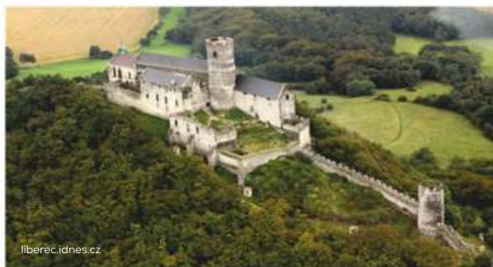
The Bezděz Castle

The dominant feature of the region is one of the most important early gothic castles in Bohemia – Bezděz . This royal castle was built on a hilltop (638 m a.s.l.) between 1260-1279 by a Czech king Přemysl Otakar II. The king Václav II. with his mother Kunhuta were held here as prisoners. During the 30years war (1618-1648) the castle was burned down by Swedish soldiers. Later it has been turned into a Benedictine monastery. After the Benedictines have left around the year 1785, the castle became deserted. It became a romantic ruin, which is described in many works by the most important Czech romantic poet – Karel Hynek Mácha.